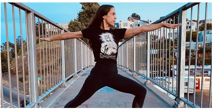
How To Improve Your Focus and Limit Distractions

Free 60-Minute Virtual Online Relaxation Yoga with Sita