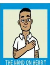
THE HAND ON HEART