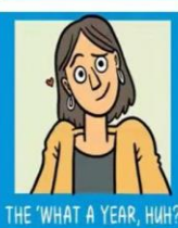
THE 'WHAT A YEAR, HUH?'