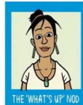
THE 'WHAT'S UP' NOD