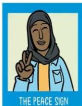
THE PEACE SIGN