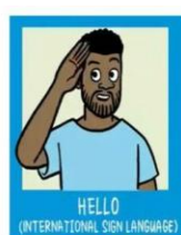
HELLO (INTERNATIONAL SIGN LANGUAGE)