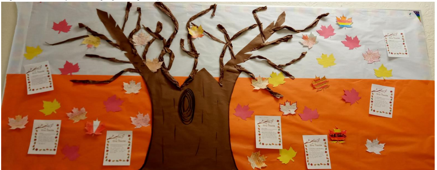
Ms. Ortiz' class created a "Thankful Tree" to express their gratitude. We are thankful they shared it with us!